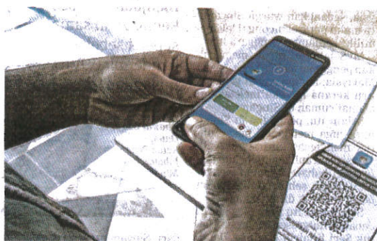
Pengembara masuk negara ini wajib muat turun MySejahtera. (Foto hiasan)

Mereka boleh mendaftar dengan menggunakan nombor telefon atau alamat e-mel yang sah, sebelum memasukkan nombor OTP yang dihantar menerusi sistem pesanan ringkas (SMS) atau